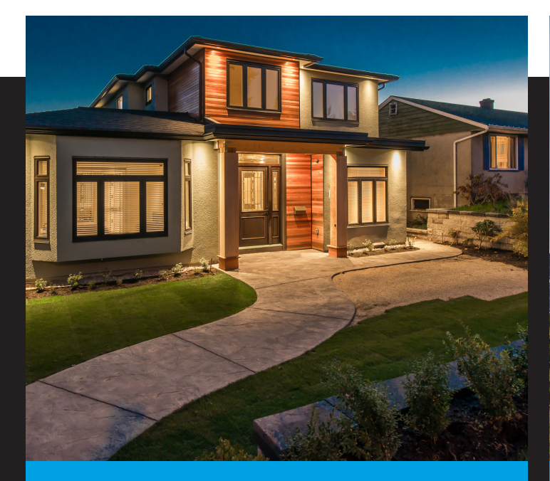
GOOD FOR HOMEOWNERS.