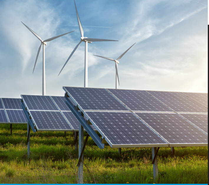
GOOD FOR SUSTAINABILITY.

R-32 refrigerant's impact goes beyond sustainability — it's a low global warming potential (GWP) refrigerant that can allow for high HVAC system performance, efficiency, and ease of use as a single-component refrigerant.